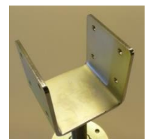
Stilt 3 Inch