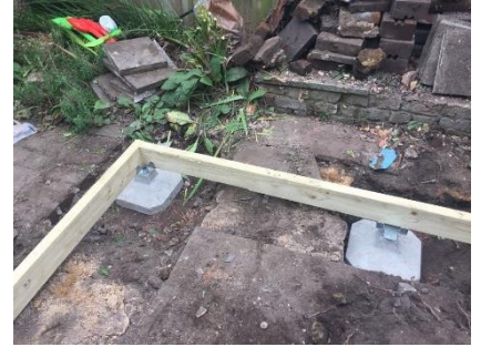
System bridges over obstacles