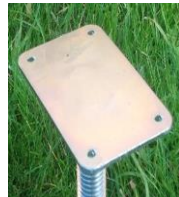
4 x 3 Flat Plate