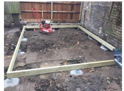
Lightweight & easy to carry to site