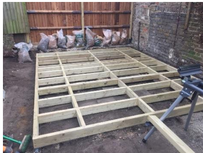
Floor frame low to ground