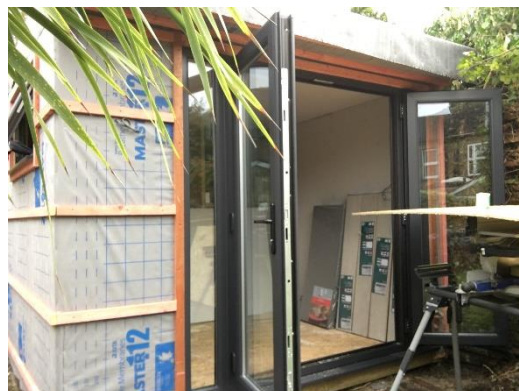
System helps to maximise internal accommodation height