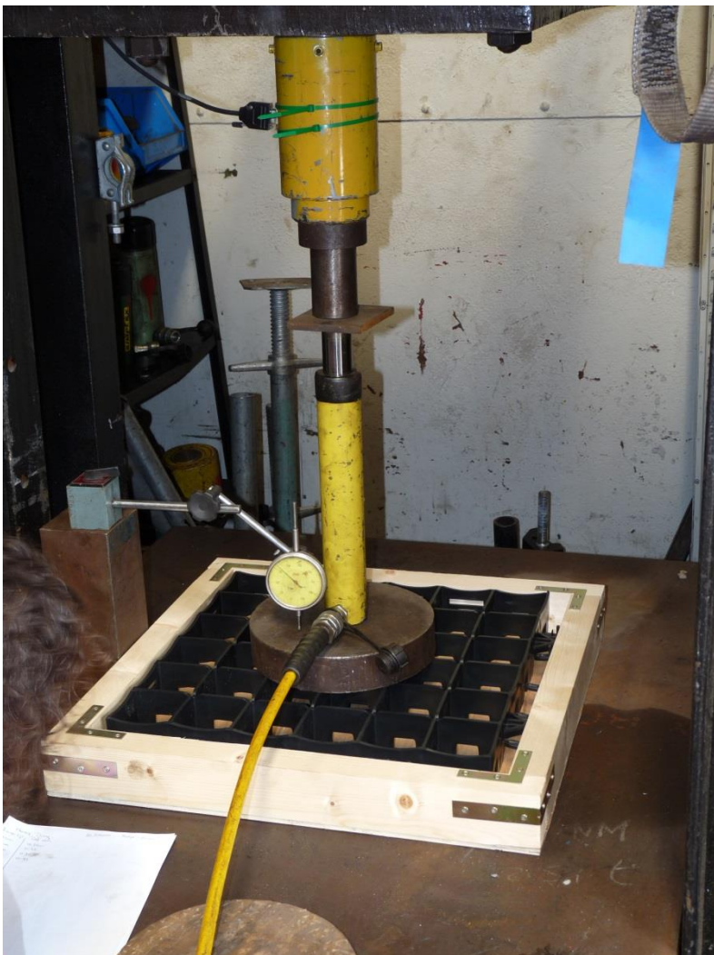
51 Tonnes Empty